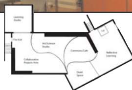
Whiston & Prescot TME